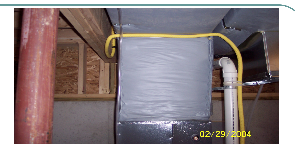
Not "preferred" method for routing and securing CSST