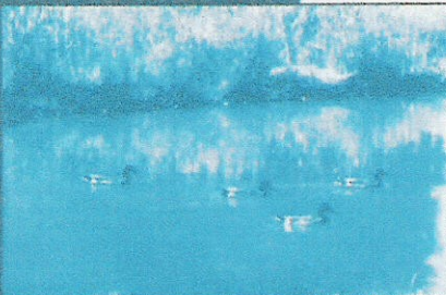
Restored wetland. Carefully designed open water habitat supports ducks as well as fish that eat mosquitoes.

Prior to its restoration in 1999, the two-acre Edmond Avenue wetland was in critical condition. Residential development near Portsmouth, New Hampshire, had partially filled the wetland, and urban and stormwater runoff had contaminated the water. Increased sedimentation had reduced the extent of open water, and invasive plants choked native species.