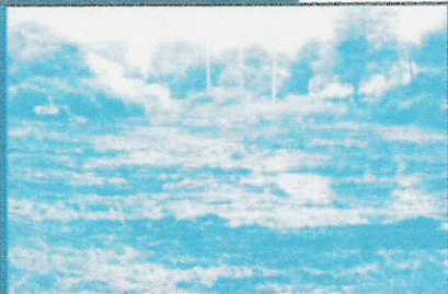
Degraded wetland. Shallow, stagnant ponds harbor many mosquitoes.