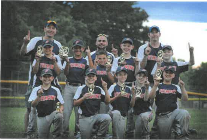
Fremont's Majors 60 (also known as the Fremont YardGoats) baseball team who just won their end of season tournament!