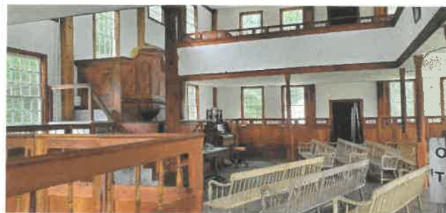
Fremont Historic 1800 Twin Porch Meetinghouse