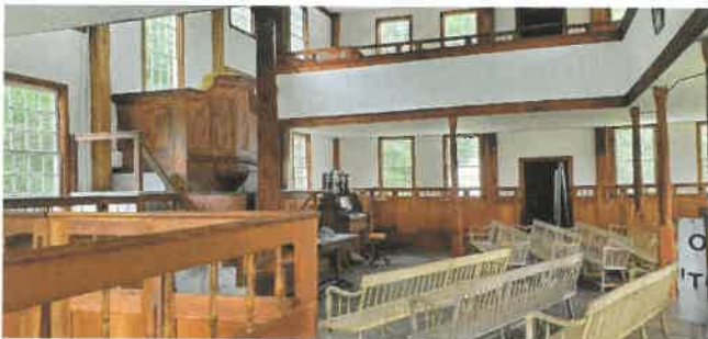
Fremont Historic 1800 Twin Porch Meetinghouse