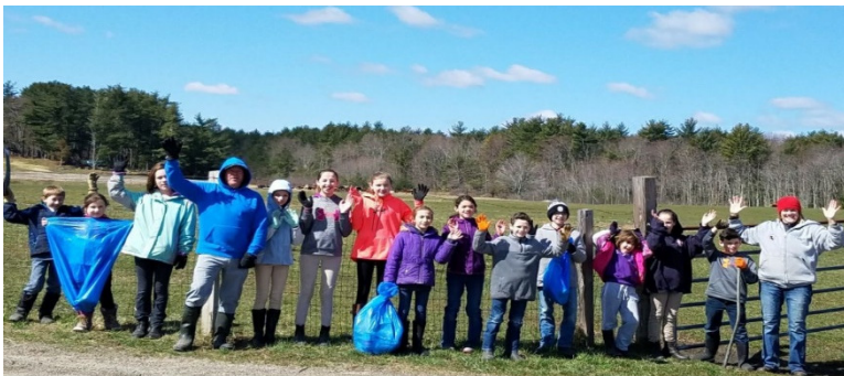
Peppermint Ponies 4-H Club working to keep Fremont beautiful!

Thanks to all the individuals who participated to keep the streets of Fremont clean! Also, thanks to the Fremont Town Market for the supply of donuts!