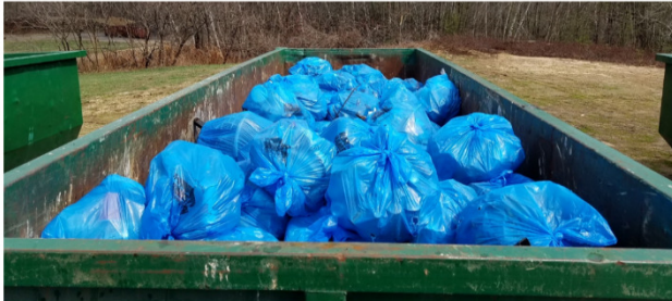
40-YARD DUMPSTER FILLED!