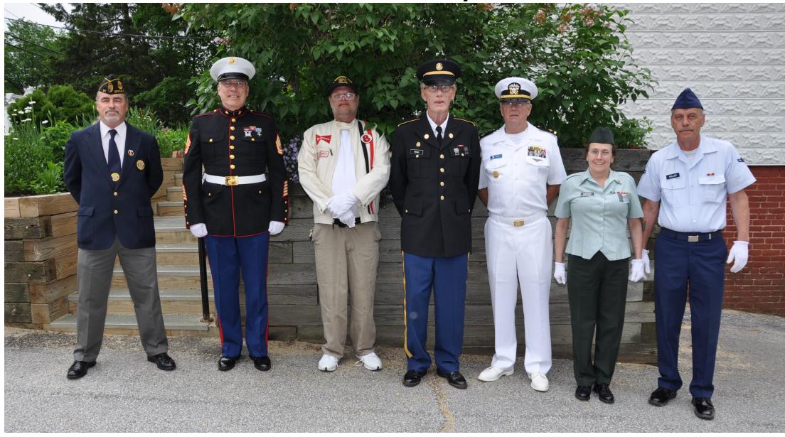
Thank you to all the men and women of our Armed Services Past ~ Present ~ Future