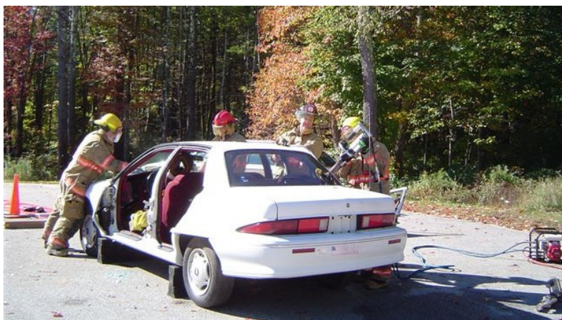
Fremont Fire Rescue Department Members Auto Extrication Demonstration at Fire Prevention Day Activities October 2007 ~ Fremont Safety Complex