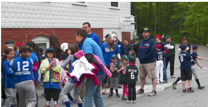
Fremont Youth Teams lining Up for the annual Memorial Day Parade 25 May 2014