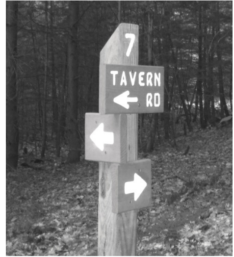
Oak Ridge North Trail Signs - Which way to go?