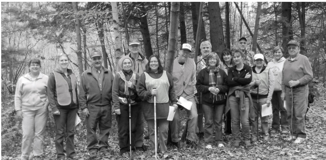
Fremont Fall Foliage Hike 2011 - Happy hikers about to experience the new trail system in Oak Ridge North.