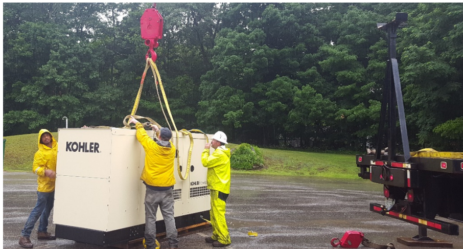
A crane moving in the new generator to the pad at the Safety Complex.

Old generators from the Town Hall and Safety Complex were sold following a sealed bid process and repurposed for various uses!