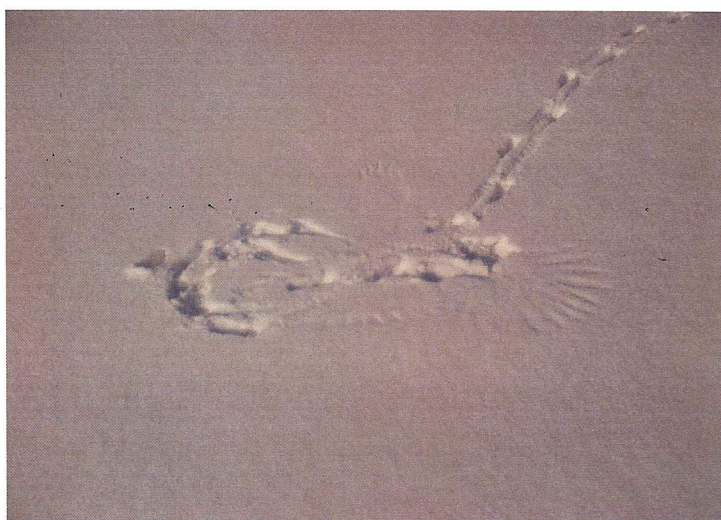
Conservation Lands of Spruce Swamp ~ January 2012 Disturbances in the snow from some sype of raptor, believed to be a red-tailed hawk, after a fresh, cold, nighttime January snowfall.