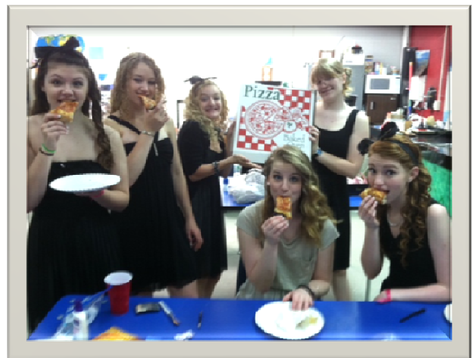
Girls enjoying Fremont Pizzeria before the opening number

Sports schedules, dance, and scout events. They travel near and far. Families have so much to do And everyone has a car.