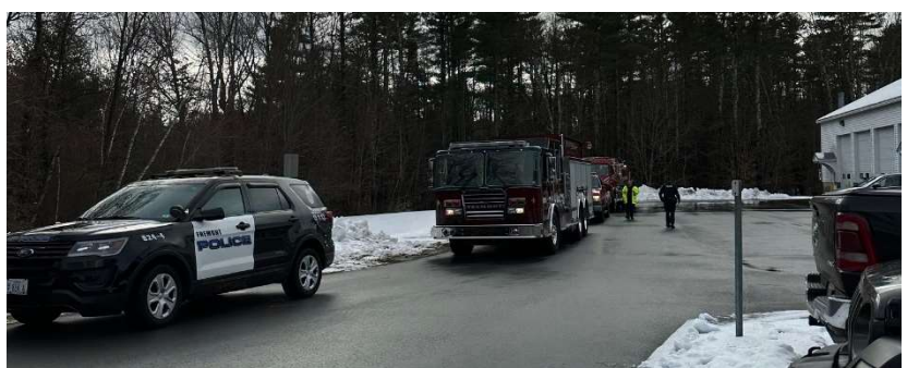
Preparing to escort Santa December 17, 2022

Fremont and neighboring officers training on Defensive Tactics at the Town Hall on December 9, 2022.